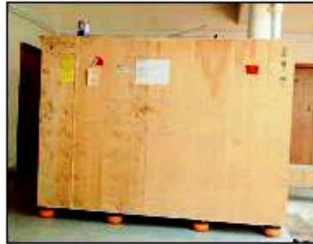
The ₹3 crore mass spectrometer has been lying unused at the Centre for Earth Sciences in the IISc campus

The question is, why did the IISc spend Rs 3 crore on an instrument, when the University of Toronto had agreed months in advance to gift the same to the institute. And why is the Rs 3-crore equipment lying unused over the past eight months?